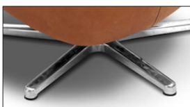
OPTION 1: STAINLESS STEEL BASE