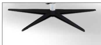
OPTION 2: STAINLESS STEEL BASE TITANIUM FINISHING