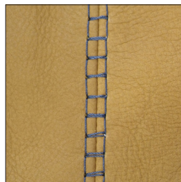
DECOR STITCH: Available Type "D"