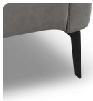
OPTION 2: STAINLESS STEEL TITANIUM FINISH FOOT