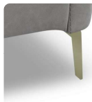
OPTION 3: STAINLESS STEEL GOLD FINISH FOOT