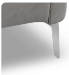
OPTION 1: STAINLESS STEEL FINISH FOOT