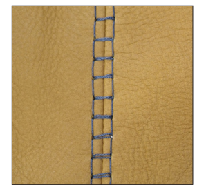
DECOR STITCH: Available Type "D"