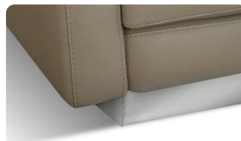
FOOT OPTION 3: STAINLESS STEEL FOOT