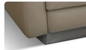
FOOT OPTION 4: STAINLESS STEEL FOOT TITANIUM FINISHING