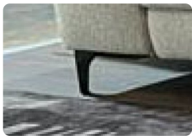
BASE OPTION 1: BASE STAINLESS STEEL EFFECT