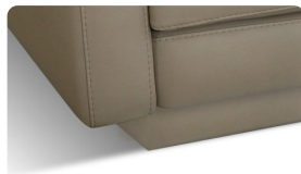
BASE OPTION 2: SAME LEATHER COVERING AS THE SOFA