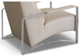
FOOT OPTION 1: STAINLESS STEEL FINISHING ARM SLED