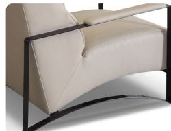
FOOT OPTION 2: STAINLESS STEEL TITANIUM FINISHING ARM SLED

LEATHER COLOR SHADE DIFFERENCES: The model upholstered with some Natural leather such as Maya, Moss, Carees and Sensation, could present in some area differences in color tones of about 5%. Such differences are not to be considered defect but an expression of the natural characteristic of the cowhide. The company reserves the right without prior notice to make technical sheets changes and/or materials for quality product improvement. Leather sofas are a handmade product and according to the leather covering selected there could be a measurement tolerance of about 2 inches (cm 5) on each sku.