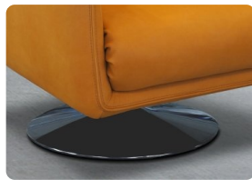
FOOT OPTION 2: TITANIUM FINISHING BASE