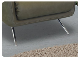
FOOT OPTION 3: STAINLESS STEEL FINISHING