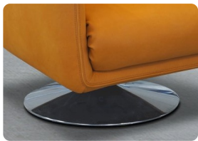
FOOT OPTION 1: STAINLESS STEEL FINISHING BASE