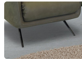
FOOT OPTION 4: TITANIUM FINISHING

LEATHER COLOR SHADE DIFFERENCES: The model upholstered with some Natural leather such as Maya, Moss, Carees and Sensation, could present in some area differences in color tones of about 5%. Such differences are not to be considered defect but an expression of the natural characteristic of the cowhide. The company reserves the right without prior notice to make technical sheets changes and/or materials for quality product improvement. Leather sofas are a handmade product and according to the leather covering selected there could be a measurement tolerance of about 2 inches (cm 5) on each sku.